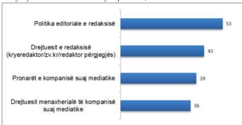
Graphic 1: Influential factors of the editorial structure (% of responses "very influential" and "extremely important")

The owners of news organizations rank right after editors in chief in terms of influence, not before them like it has been in other surveys with a smaller sample conducted by the Media Institute. Some of the responses seem to be contradicting each other at first consideration. Earlier, we saw that politics (politicians and government officials, etc.)