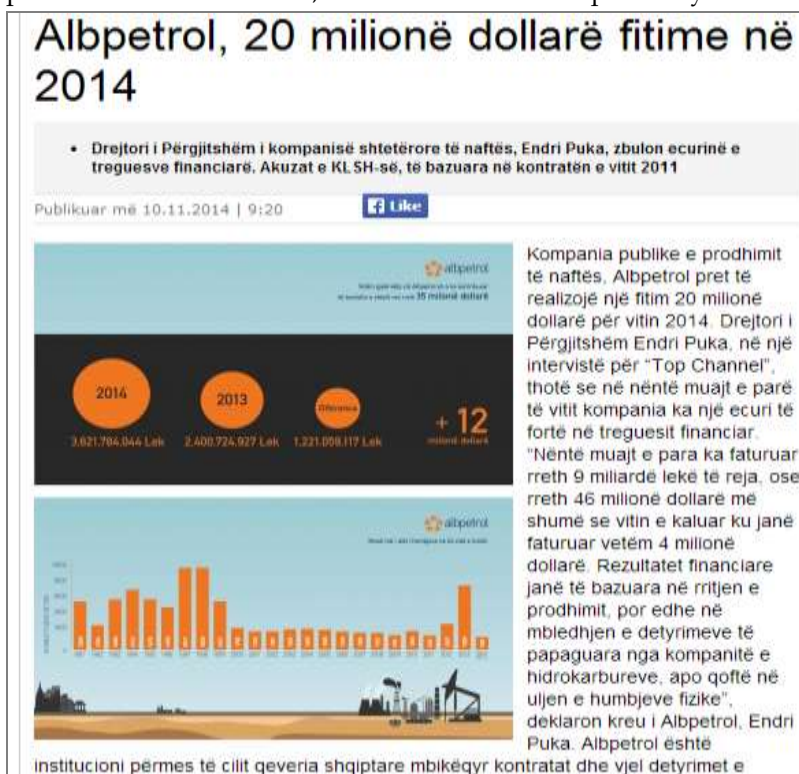
Print-screen from shekulli.com.al, date 10.11.2014

cases where this practice occurs, it is limited to the presentation of data through graphics similar to Excel charts, as you can see in the following case from shekulli.com.al where the revenue growth of Albpetrolcompany is presented graphically. In this case, the text next to the infographic is a kind of repetition of the data displayed in the infographic. But, in the best of their examples, the infographic products stand on its own, without the need of explanatory texts.